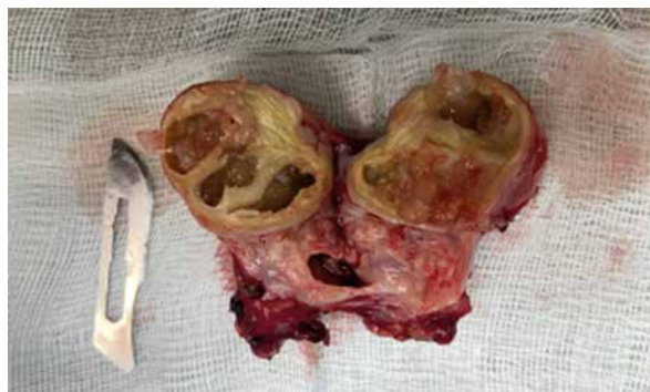
Fig. 2. Macroscopic view of the left ovary

The clinical picture of pelvic echinococcosis is non-specific: abdominal swelling, abdominal pain, menstrual abnormalities, infertility, and urinary disturbances [9]. Ovarian or uterine echinococcosis can mimic polycystic ovaries or malignancy [10, 11], multicystic ovarian tumour, haemorrhagic ovarian cyst, endometrioma, cystadenoma, leiomyoma, etc. [19, 20].